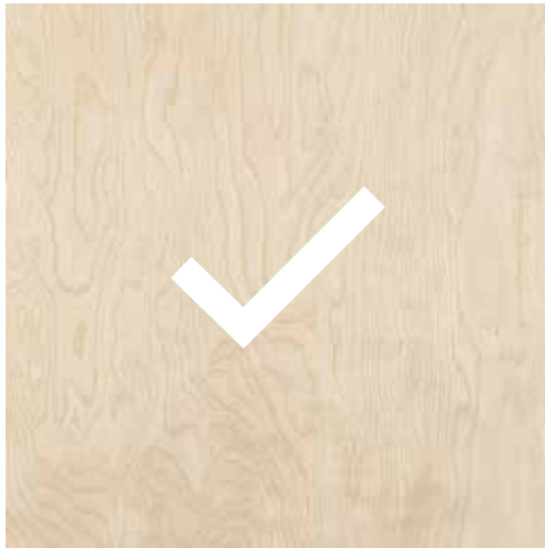
TOP 'AB' SURFACE QUALITY

All our wood is the highest quality 'AB' grade, which means it is free from knots, patches and discoloration, giving you the best quality prints.